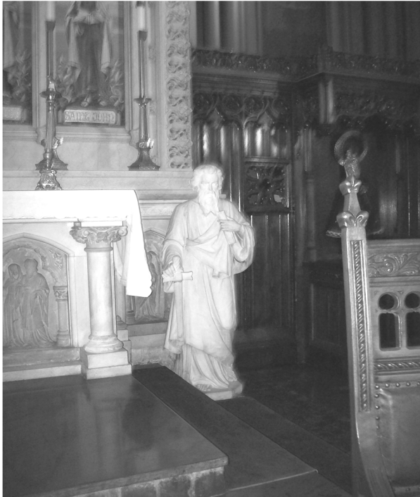
SAINT PAUL Saul of Tarsus BORN 5AD — DIED 67AD