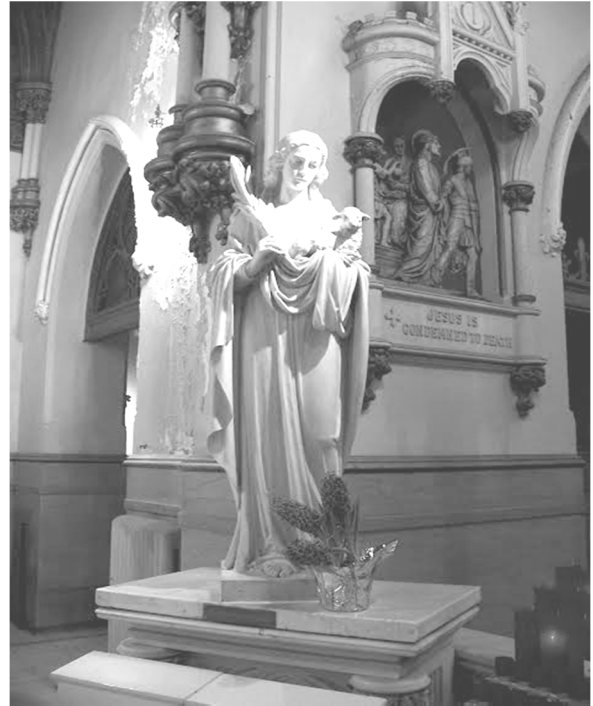
SAINT AGNES Agnes of Rome BORN 291AD—DIED 304AD