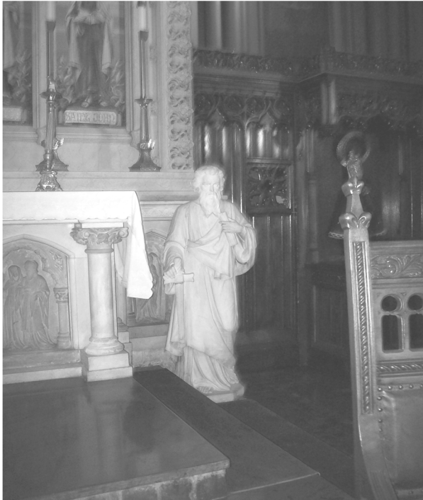
SAINT PAUL Saul of Tarsus BORN 5AD — DIED 67AD

E-MAIL ADDRESS stpaulandstagnes@gmail.com