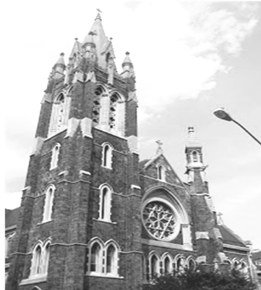
SAINT AGNES CHURCH PARISH FOUNDED 1878 CHURCH BUILT 1904