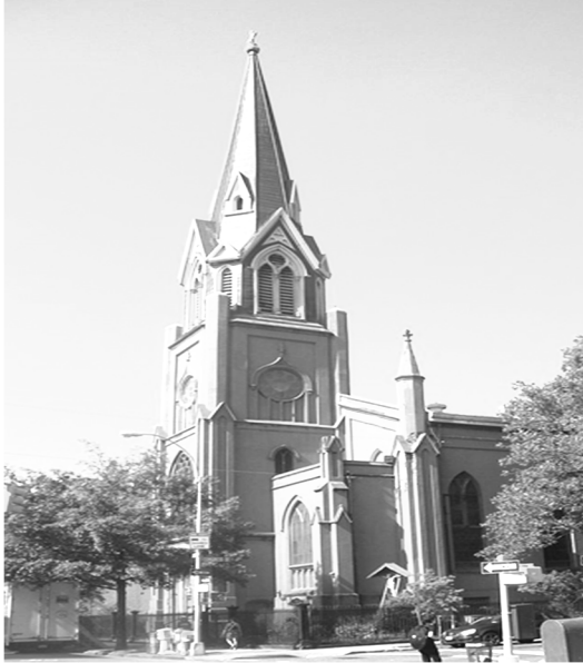
SAINT PAUL CHURCH PARISH FOUNDED 1836 CHURCH BUILT 1838

E-MAIL ADDRESS stpaulandstagnes@gmail.com