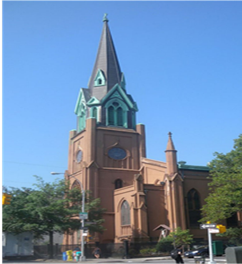
St. Paul Church