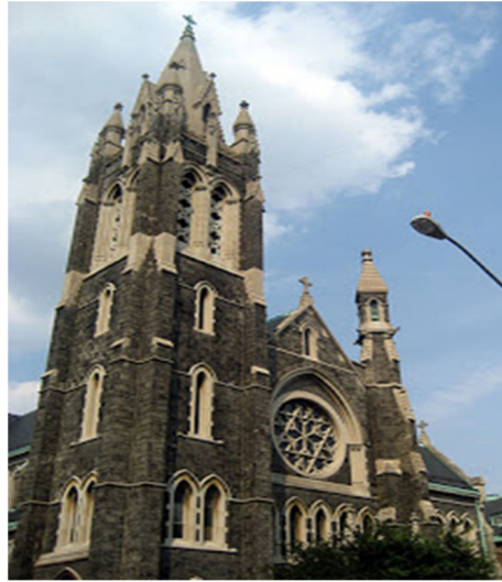
St. Agnes Church